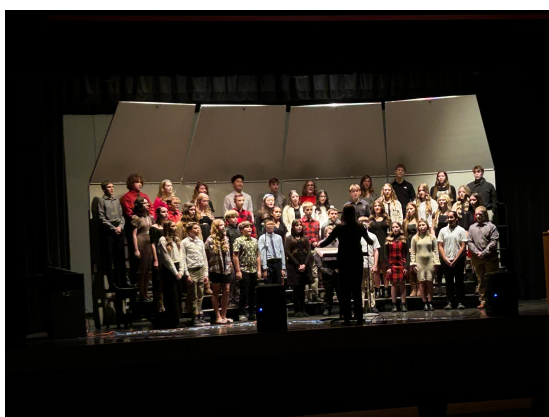
Junior High Choir Holiday Concert