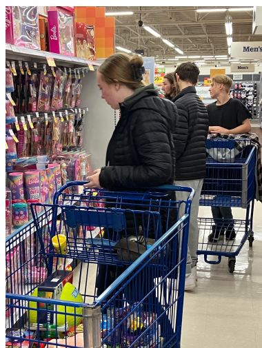
Shopping for LEO Club