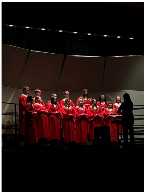
High School Choir Holiday Concert