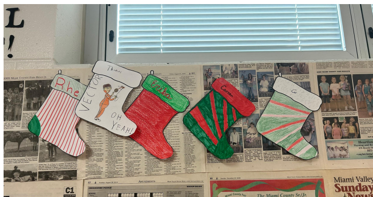
Happy Holidays from the Smoke Signal!