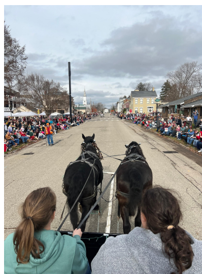
Lebanon Horse Parade