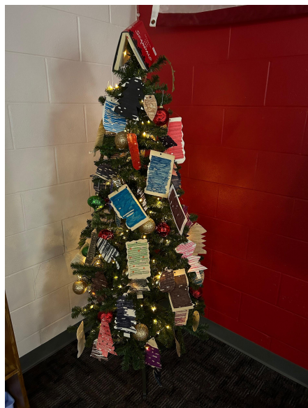
Miss Rhea's holiday tree decorated with student's poetry