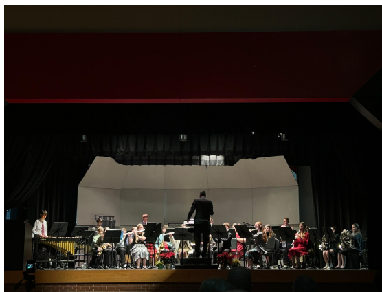
High School Band Holiday Concert