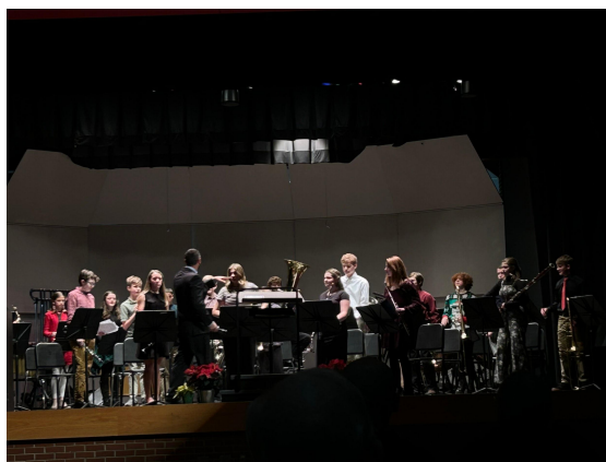
Junior High Band Holiday Concert