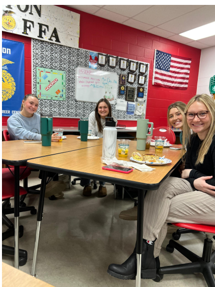
Breakfast in the ag room!